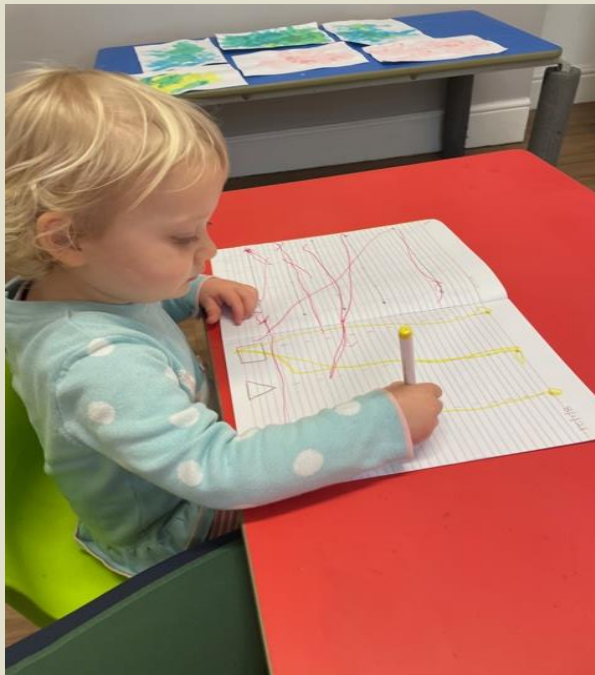
Mark Making & Messy Play